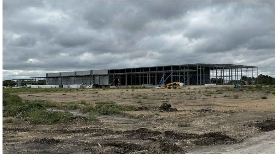
RealCold Facility under construction September 2024

Several zoning codes were updated, including: