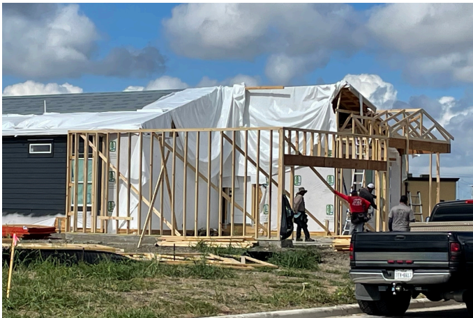
Amherst modular home, September 2024