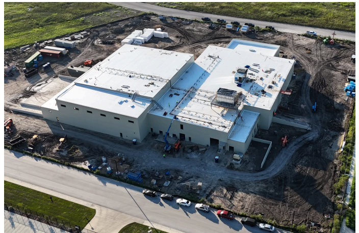
Ziegenfelder Plant, September 2024