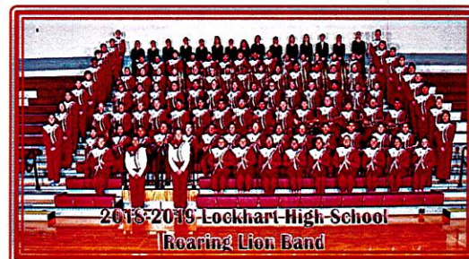
Lockhart High School Roaring Lion Band