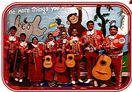
Mariachi Cielo Azul